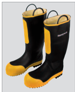
Models 1500 & 2500

Insulated (Model 1500) and non-insulated (Model 2500) lightweight models feature Kevlar®/Nomex® lining and are equipped with a shinguard for additional ladder-rung shin protection. Roomy steel toe provides extra comfort, and steel bottom plates and shanks offer unmatched impact/compression and puncture protection.