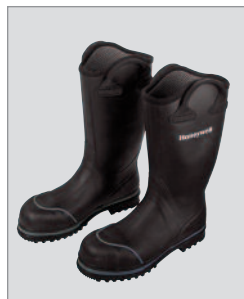
Model 1000 Ranger™ Air

Premium, top of the line model, offers complete protection and lightweight comfort. Only rubber boot on the market utilizing athletic spacer mesh material laminated to buoyant, waterproof neoprene. A combination of natural rubber and butyl rubber ensures complete chemical protection to certified standards.