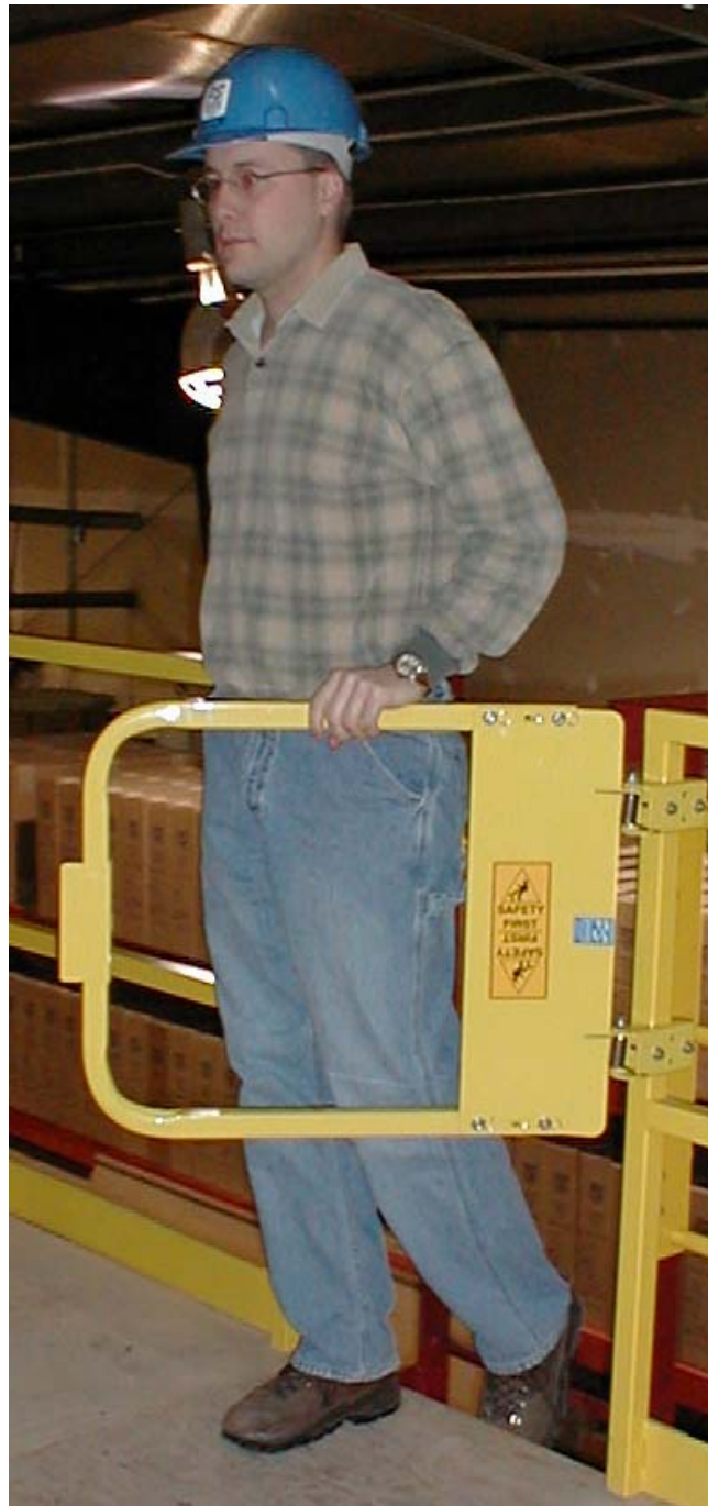
Mild Steel Gate with Powder Coat Safety Yellow (PCY)