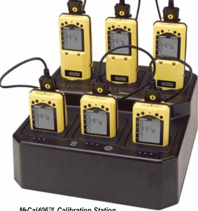
M•Cal406<sup>™</sup> Calibration Station