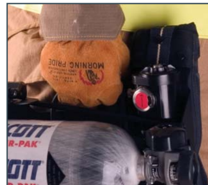
Donning/doffing and carrying handles

An enhanced latching system with durable para-aramid fabric band allow for quick and efficient cylinder changes. Simple adjustment of a cam-over center slide permits the accommodation of 30-, 45- or 60- minute duration cylinders.