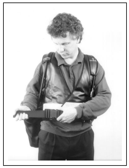
3. Pass left side of jacket around outside and secure buckle, pull strap and adjust for a comfortable fit.