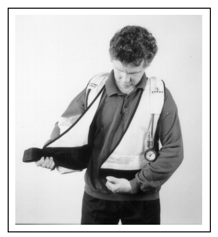
For Velcro™ fastened waistcoats: Fit left side of jacket to inside and pass right side around outside and secure for a snug fit.