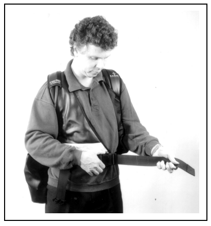
For black waistcoats: Pass right side of jacket to inside and secure buckle. Pull strap to adjust for comfortable fit.