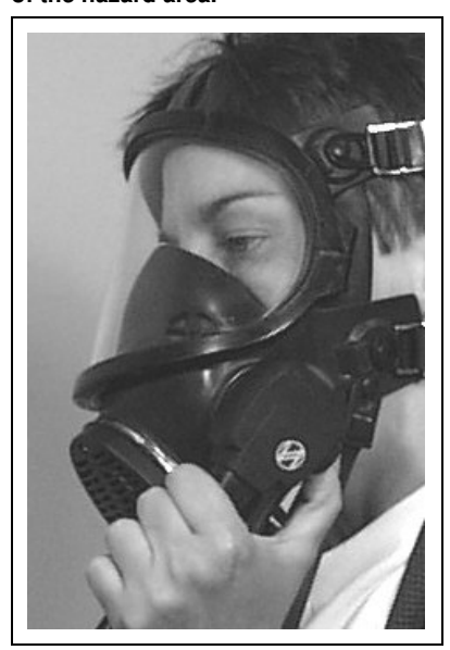
1. Take a deep breath and depress black reset button on demand valve.

DO NOT remove apparatus until clear of the hazard area.