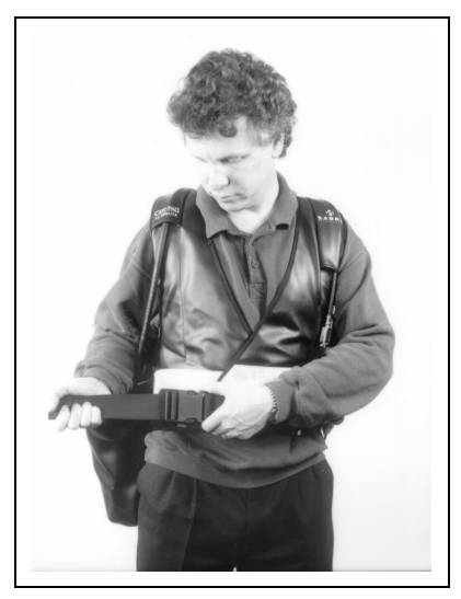
3. Pass left side of jacket around outside and secure buckle, pull strap and adjust for a comfortable fit. Tuck loose ends of straps inside waistcoat.